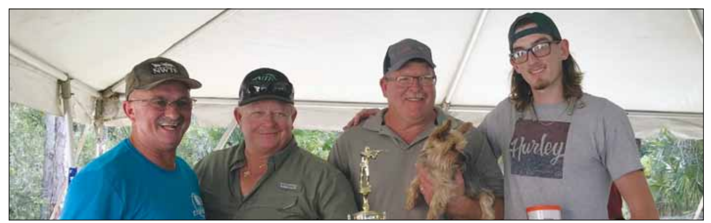
First Place team was sponsored by G.P. Solutions