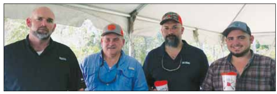
First Place "C" Flight Team was sponsored by Duda