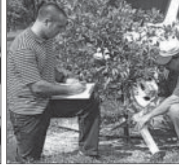
gion, was "officially" Gulf Citrus Growers Add BMPs To Their Groves!

released in February 2006. It was then GCGA continues to encourage growers to participate! In less than a year, over 48,000 "Gulf Citrus" acres have been enrolled in the BMP program.