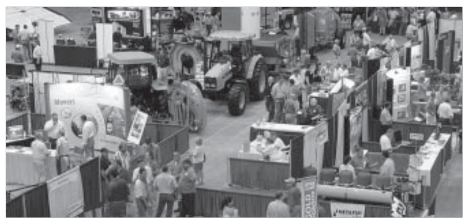
The 2007 Citrus Expo trade show promises to be "first class."

The seminar planning committee is again developing a program "by growers ...for growers"! Norm Todd, GCGA