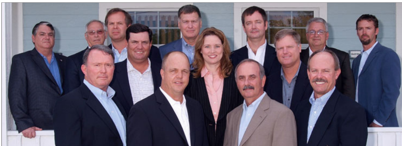
2008-2009 Gulf Citrus Growers Association Board of Directors

Each of these leaders is a volunteer, and is working on behalf of the collective benefits of all the citrus growers in the region. Please thank and support them during the coming season.