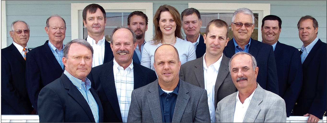
2010-2011 Gulf Citrus Growers Association Board of Directors