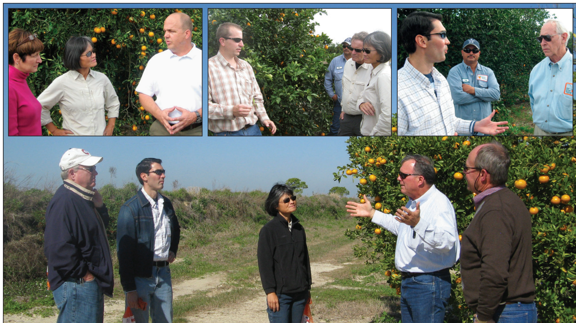
Ft. Myers News-Press executives get “Gulf” citrus growers’ messages!