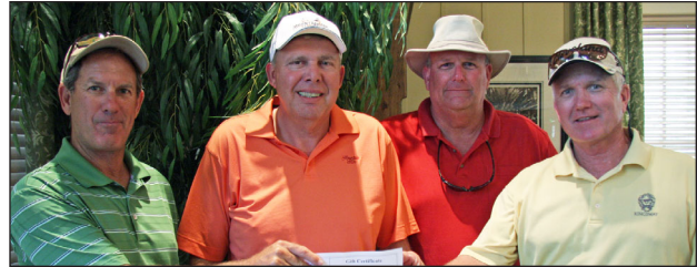
Orange Co. Foursome Places Second!