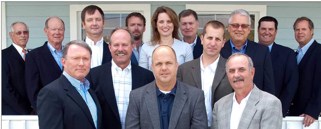
2010-2011 Gulf Citrus Growers Association Board of Directors

Each of these leaders is a volunteer and is working on behalf of all the region's citrus growers. Please thank and support them during the coming season, and also suggest any positive changes that GCGA can make to better serve the industry in the "Gulf" region.