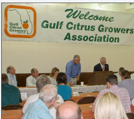
24th Annual Meeting