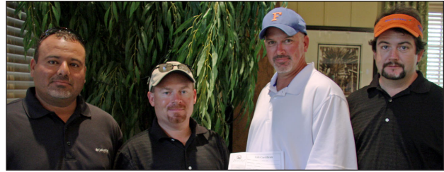
First Place Team Sponsored by Car Two!