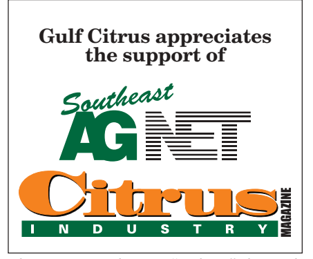
The association does not "endorse" the goods or services promoted in this newsletter.

Members are encouraged to become members of the foundation.