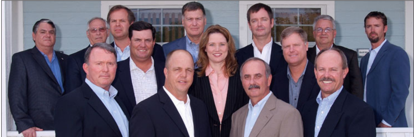
2008-2009 Gulf Citrus Growers Association Board of Directors