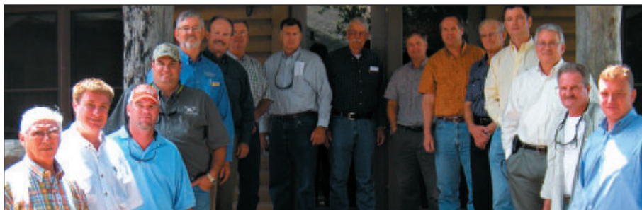
Congressman Rooney (far right, front) Discusses Federal Issues with GCGA!

The Gulf Citrus Growers Association's Board of Directors and Governmental Relations Committee recently met with Florida Congressman Tom Rooney at Hilliard Brothers of Florida. The GCGA and Florida Citrus Mutual leaders discussed the issues dealing with citrus greening, immigration/labor relations, taxation, species habitat (focused on the panther) and water management (primarily the importance of Lake Okeechobee as a source