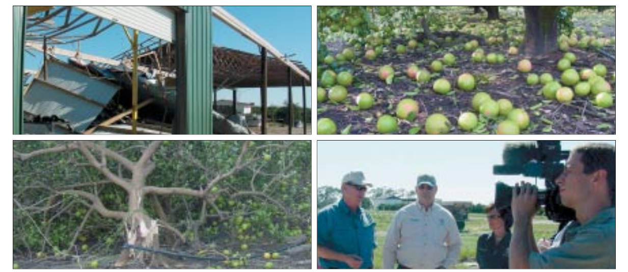
Gulf growers assess Wilma's damage to buildings, fruit and trees! Florida Agriculture Commissioner Charles H. Bronson tours growing region for "first hand" look at the hurricane's destruction.